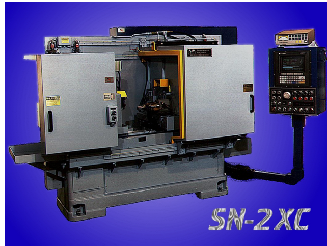
Model 2SN-2XC CNC Chucker shown with Allen-Bradley 9/230 control option, in-process gaging, and full-enclosure guarding.