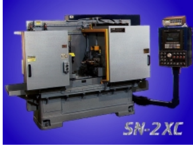
Model 2SN-2XC CNC Chucker shown with Allen-Bradley 9/230 control option, in-process gaging, and full-enclosure guarding.