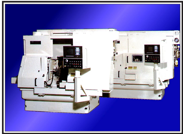
Pair of Model SN-115 CNC Water Pump Bearing Grinders, shown with full-enclosure guarding package.