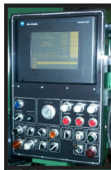
New Hi-Rez™ Operator Control with Custom Grinding Software