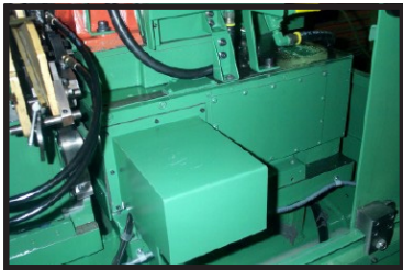
Hi-Rez™ Cross Slide Package