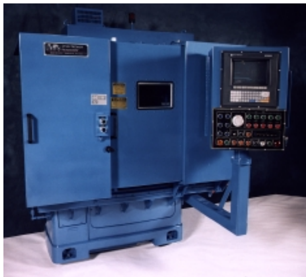
Model 1SN-2XC Chucker revealing latest version of 1SN full-enclosure guarding package.

Service Network can provide two-spindle solutions 1SN-2XC and 2SN-2XC for a variety of applications. Options include the Slide Bar configuration for simultaneous grinding, or sequential programming of two grinding spindles.